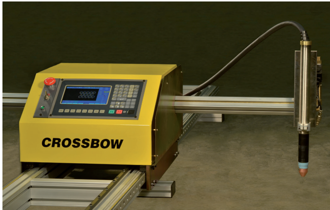
Maximum Plasma Cutting Thickness of up to 20 mm (3/4 in.)